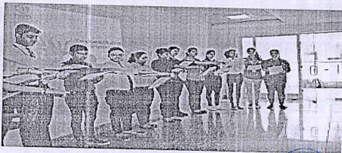
2 nd Investiture oath Ceremony